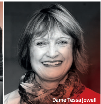
Dame Tessa Jowell