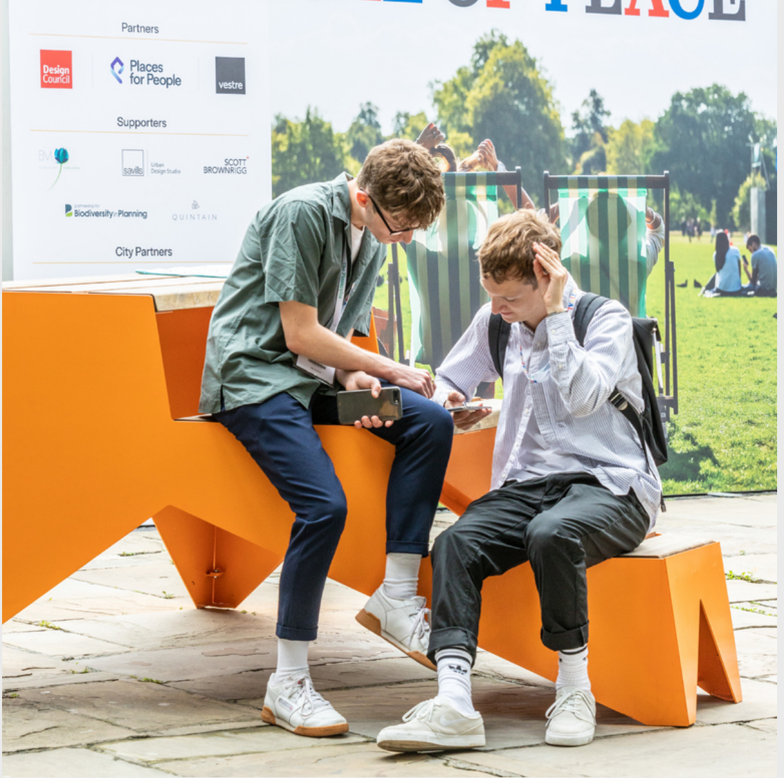
Festival of Place 2019 attendees reading the programme