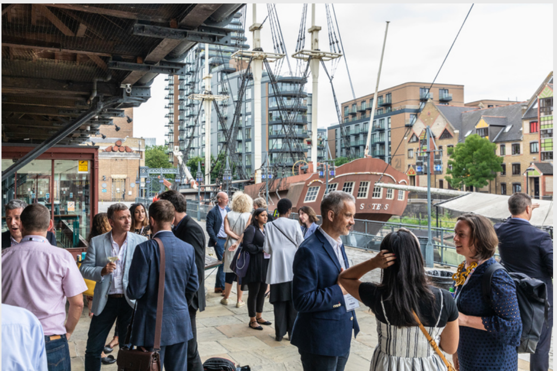
Festival of Place at Tobacco Dock in Shadwell, east London

As for the venue, it is interesting to consider the place where ‘place’ is being discussed. Tobacco Dock has always been about money, markets and the progress of capitalism. Beginning with the world trade in tobacco, it was briefly regenerated into a shopping centre in the 1990s, and now has become a venue for weddings, exhibitions and other corporate and commercial events. The interior design highlights its trade heritage, with exposed iron girders, wooden beams and bare brick walls (although I’d argue the replica pirate ships take things to a level of make-believe). Yet trade has long since given way to PowerPoint, plastic chairs and Post-it notes.