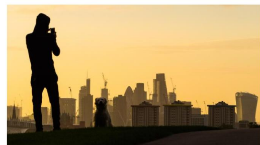
Companies have to pay $110 per sq ft of office space in a London skyscraper