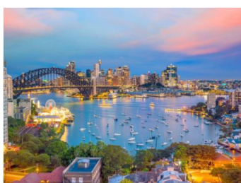
Downtown Sydney, Australia

Take a look at how much office space $100 million buys: