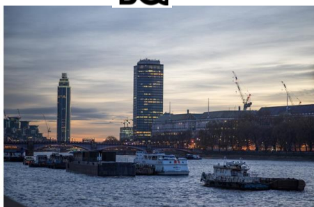
London offices on the Thames