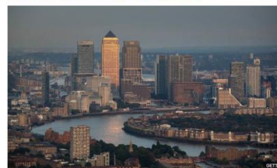
Virtual Street? London's offices command highest rents in Europe.