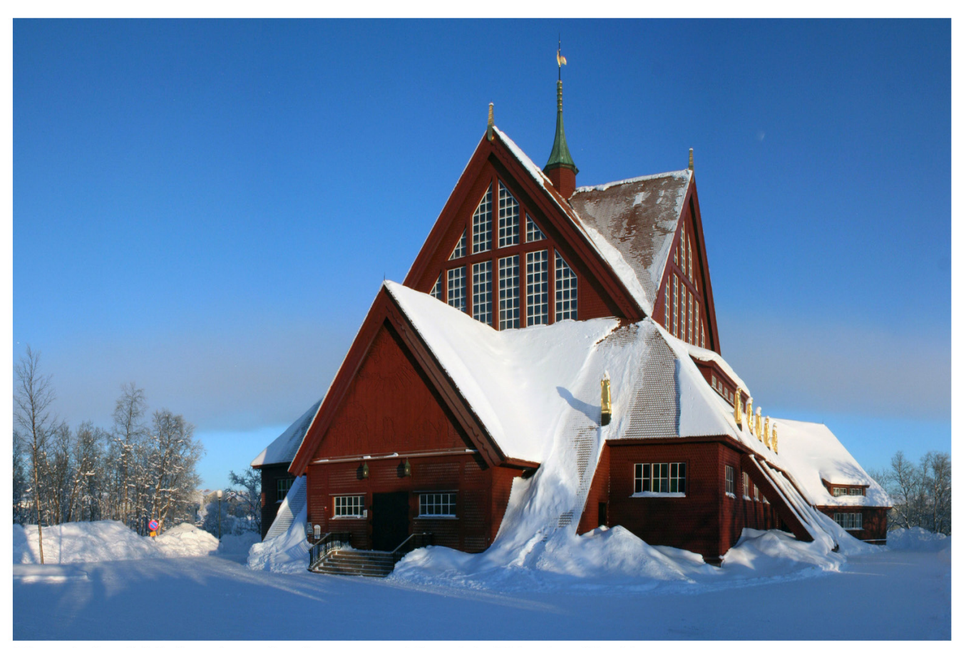
Kiruna's church is being relocated to the new town.

Cars' team discovered that smaller and seemingly insignificant elements made a big difference to the sense of place. Predicting these was almost impossible. But by listening to residents, they were able to assess what things had the biggest impression on locals, and extended the scope of what needed to being moved.