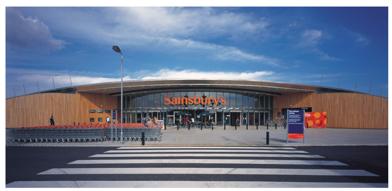
Sainsbury's Greenwich, the UK's most sustainable supermarket, was demolished to build the IKEA store.

IKEA has clearly put every effort into creating a environmentally-friendly store. Designed by SRA Architects, the building looks on the face of it like you'd expect an IKEA to look. But behind its familiar blue face, it incorporates numerous green technologies: rainwater harvesting will contribute half the water used in the building, its circulation areas are naturally lit and LED lighting has been installed throughout.