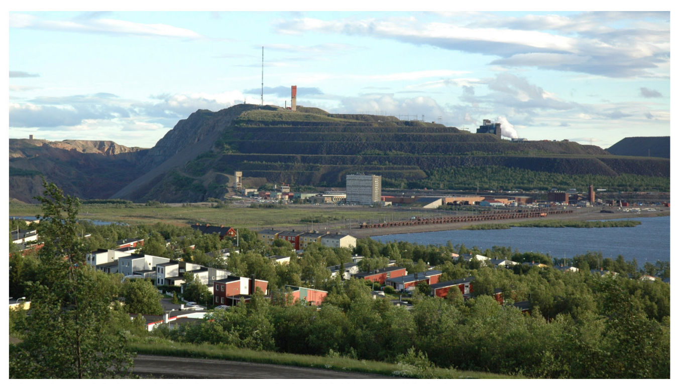
Kiruna's move is being funded by the state-owned mine, which is responsible for its undermining.

Like Kiruna, many of the world's coastal communities have also been facing impending destruction for years.