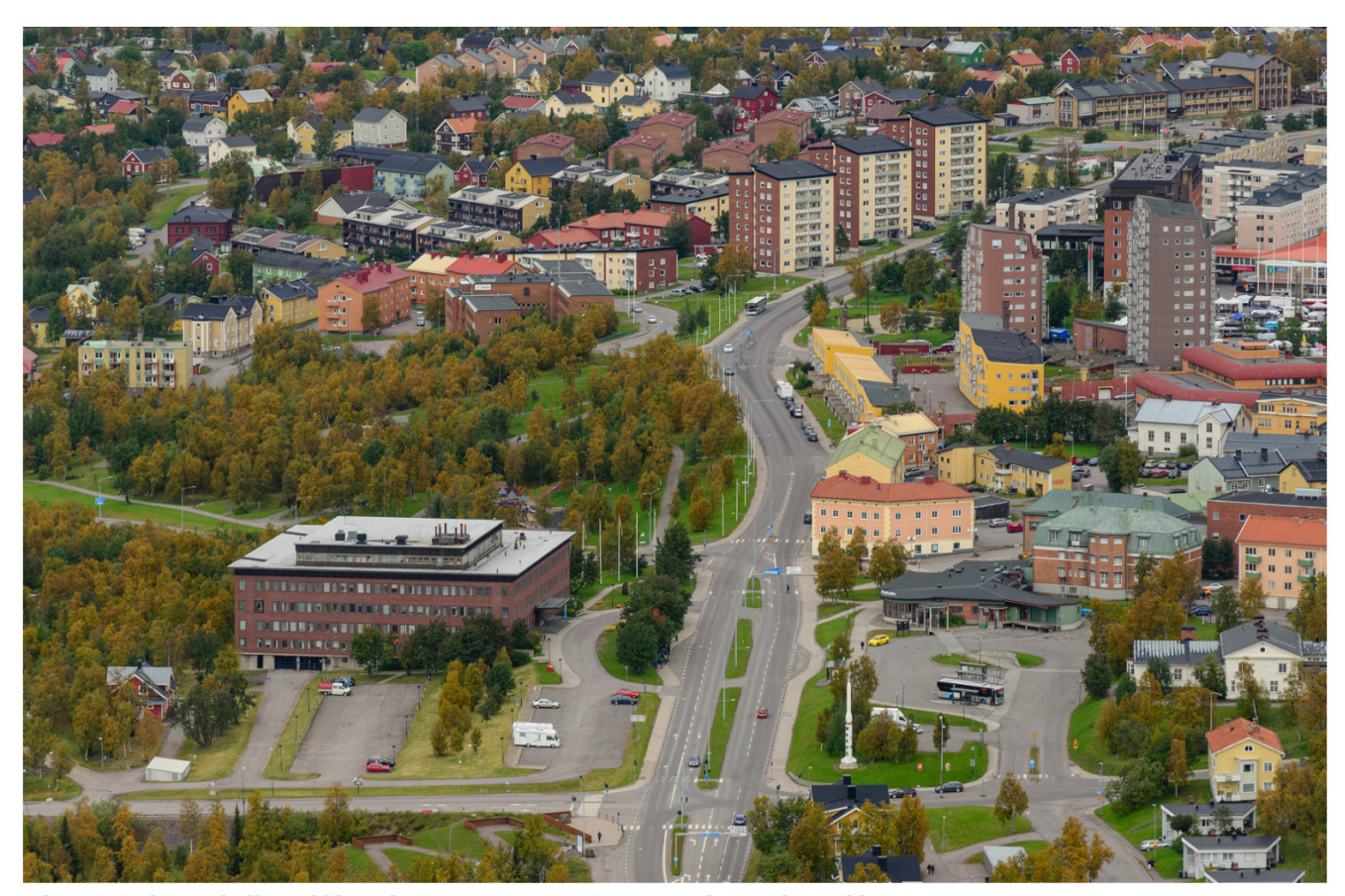
The original town hall would have been too expensive to move.

Even with its funding covered, there are still strict restraints determining what can be moved in Kiruna. In the majority of cases moving is more expensive than simply building from scratch, meaning each building or item that is relocated comes with an additional financial burden to the mine.