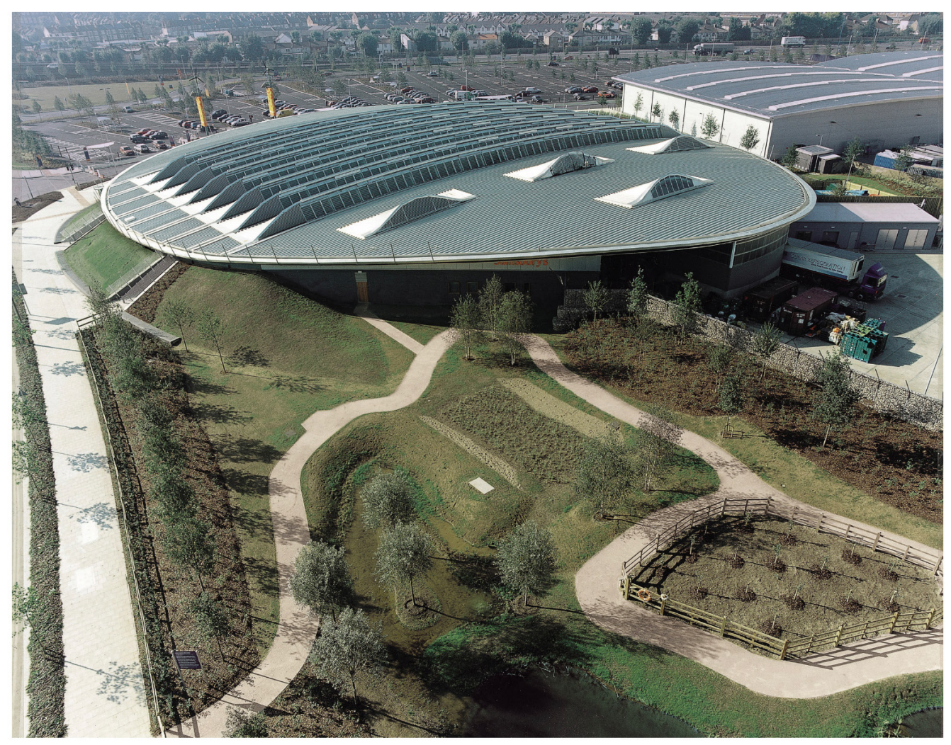
Sainsbury's Greenwich had "sustainability in its DNA" said Laurie Chetwood.

While the IKEA may have passed BREEAM's sustainability test, does it push the boundaries of green design like the Sainsbury's did? Not only did it have add-ons like rainwater harvesting and solar power, but the entire store was naturally lit with large rooflights. As Chetwood puts it: "Sustainability was in Sainsbury's DNA".