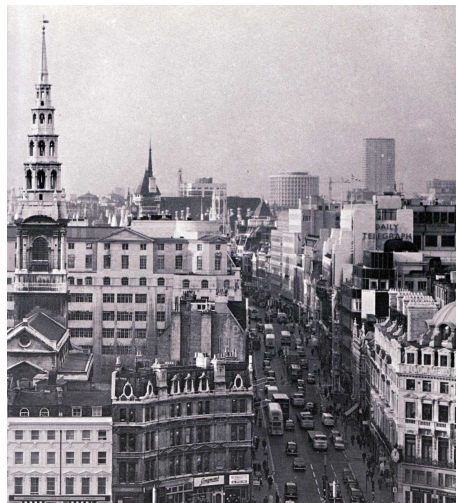
Fleet Street – 1960's